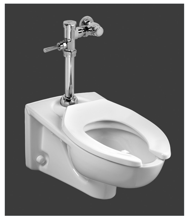
SEE REVERSE FOR ROUGHING-IN DIMENSIONS