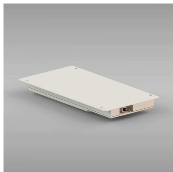
Top view (see installation next page)