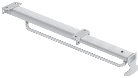
KV1 Sliding Clothing Carrier