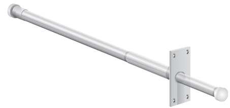
753 Sliding Hang Rod