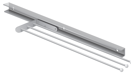
P793 Sliding Towel Bar