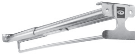
KV1 Sliding Clothing Carrier